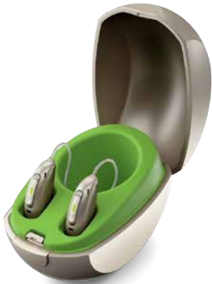
Phonak Audéo Paradise

Is the high tide breaking on the shore one of the wonders of sound?