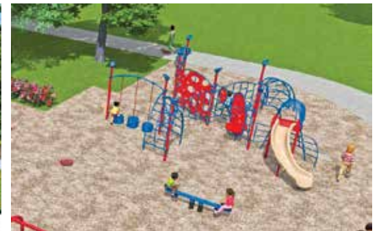
Playground equipment in Bradley Road Park – Phase 3