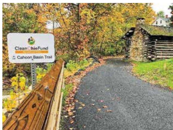
Cahoon Park Basin Trail

7,316 tons of refuse were diverted from the landfill by recycling and composting