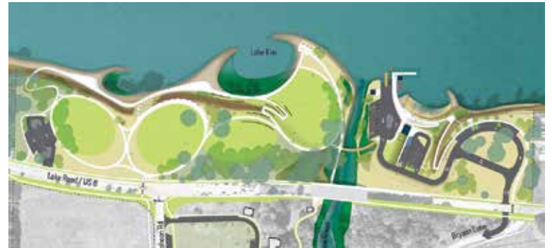
Lakefront Master Plan in Cahoon Park