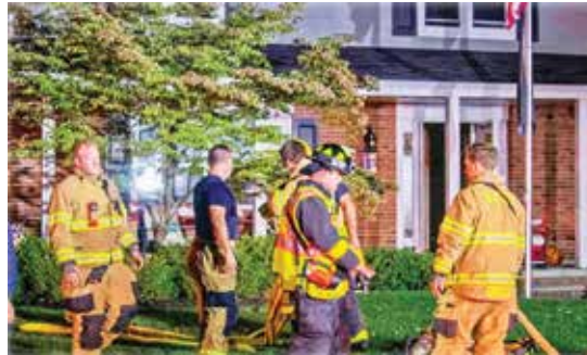
Bay Fire station upgrades are coming with funding support.