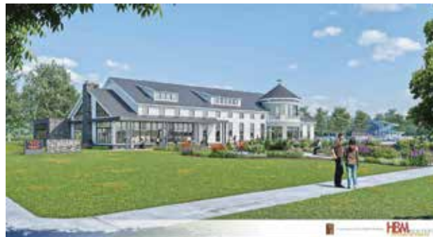
Bay Village Library in Cahoon Park