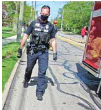
Bay Police service calls have decreased from 2019.