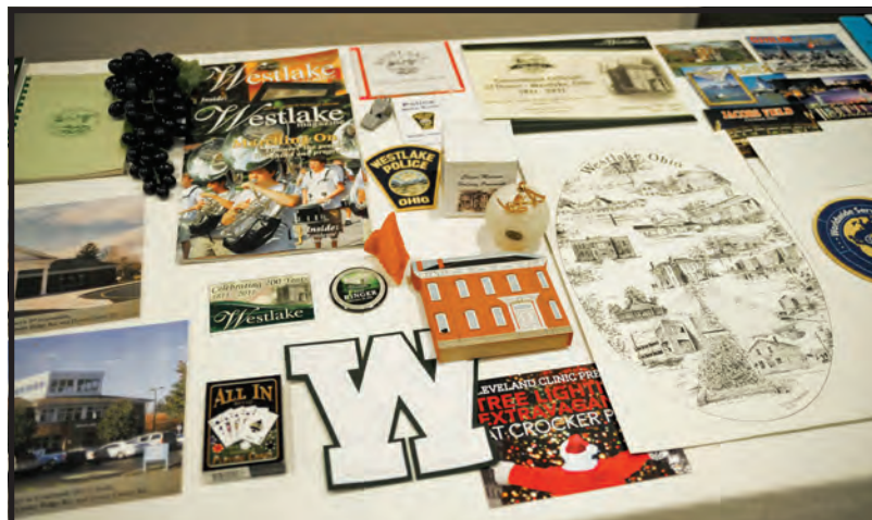
A representation of some of the items placed in the Westlake Time Capsule.