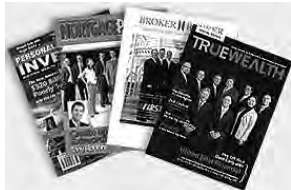
featured in several national publications

*** Mortgage, Insurance, and Financial Professional are also invited to see how you can help your current and past clients